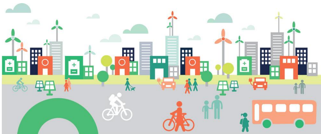
Image 1. Illustration from FME ZEN